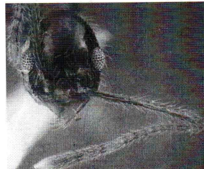
Adding ants: Pheidole subsphaerica (top), P. cursor and P. lupus are three of 337 new ant species described by E. O. Wilson.

trated glossary, and an uninspiring, unillustrated key to species. The pièce de résistance is an accompanying CD-ROM, which comprises fantastic colour images of about half of the species and a simple search engine.