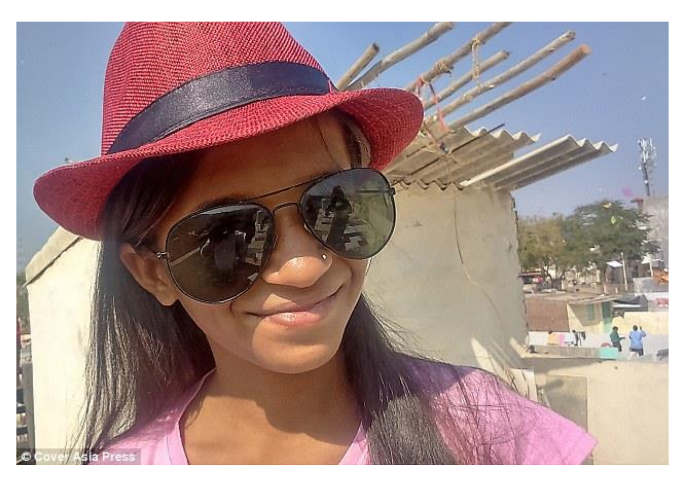
Creepy crawlies: Her problem started in August last year, and so far, doctors have removed more than 1,000 ants from her ears