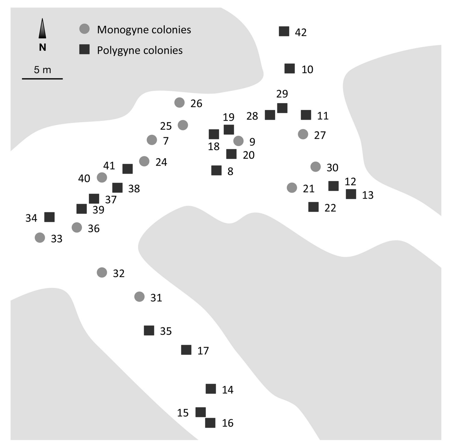
Fig 1. Map of the study area of Pheidole pallidula at Bruniquel (Tarn-et-Garonne, France; N44.05011 E1.65621). Filled circles: monogynous colonies (n = 13). Filled squares: polygynous colonies (n = 22). Grey areas represent sparse vegetation composed mainly of grasses, as well as junipers ( Juniperus communis ) and downy oaks ( Quercus pubescens ) (S1 Table).